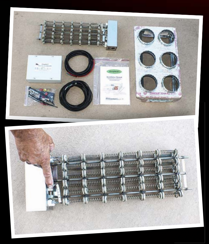
(Top) The plenum normally arrives in the kit without the ducting holes, but was factory predrilled for the specific furnace used in the test installation. (Above) The heating element is equipped with a fusible link that prevents catastrophic failure.

Adding an RV Comfort Systems electric element to an existing furnace may be a cost-effective alternative to burning LP-gas