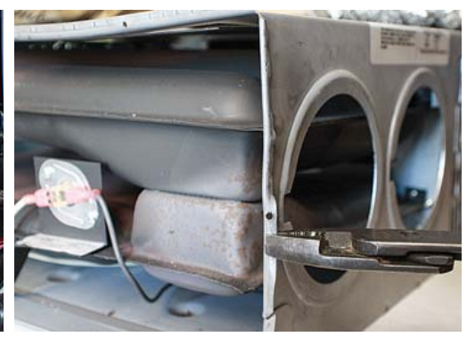
(Above, from left to right) Flexible ducting is routed from six ports in the stock Suburban furnace in the test fifth-wheel. The ducting and collars are removed from the rear panel of the furnace to start the installation process. On this Suburban furnace, pliers were used to fold the tabs flat on both sides of the furnace to allow the new plenum to fit properly.

system of ducting and registers using the furnace's blower motor. A switch allows the user to choose between gas and electric heat.